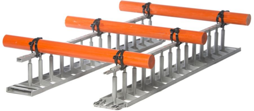
Fully assembled 1-1/2" GFRP Dowel Baskets at 12 inches o.c.

To complement the FiberDowel™, Fiberglass Dowel Bar, RJD offers an all plastic basket system to satisfy this specification.