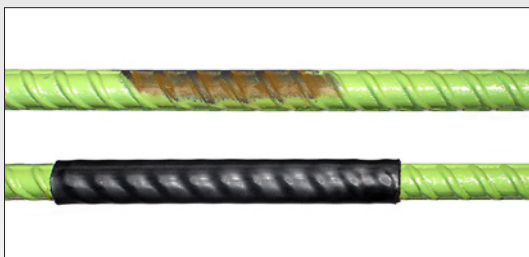
After Rebar Coupling or Repairing Damaged Rebar Epoxy Coatings