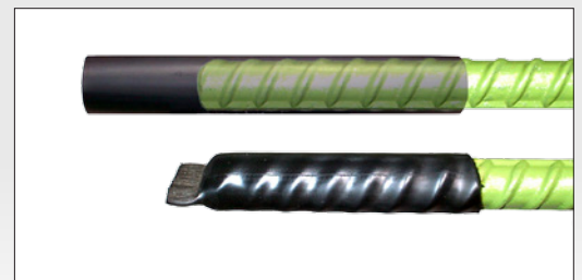
Sealing Rebar End Corrosion